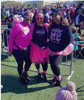
Breast Cancer Walk