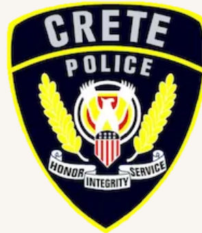
CRETE POLICE DEPARTMENT