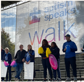
Autism Speaks Walk