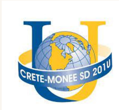
CRETE-MONEE SD 201-U