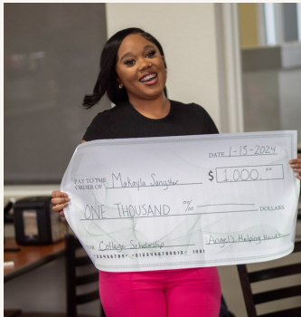
Angel's College Scholarship Recipient