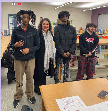
Launch of Diversion Program