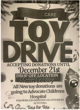
Toys for Tots