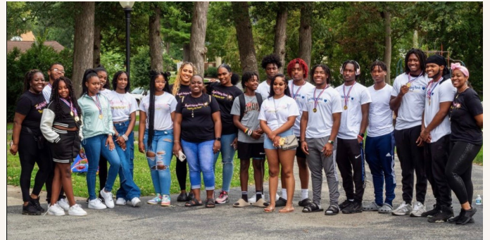
Annual Back to School Fair

91% MENTEES COMPLETION RATE OF FULL CYCLE