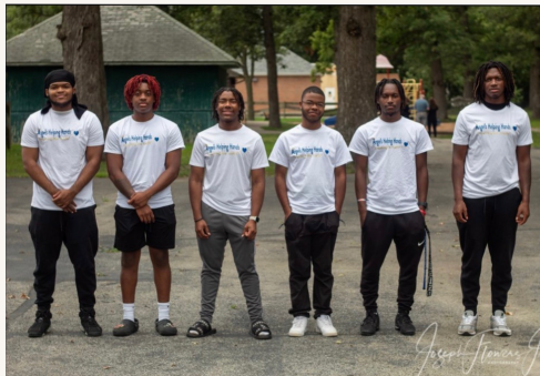
Launch of Sons of Excellence Program