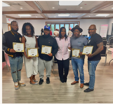
Annual Career Day