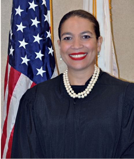
JUDGE JESSICA COLÓN-SAYRE 12TH JUDICIAL CIRCUIT COURT OF WILL COUNTY, IL